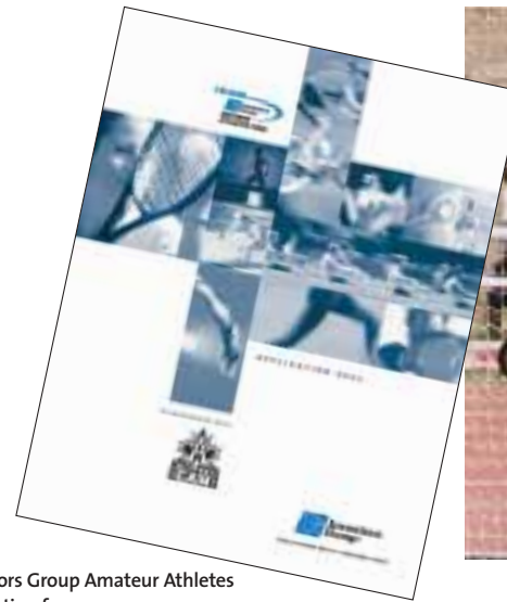
Team Investors Group Amateur Athletes Fund application form.