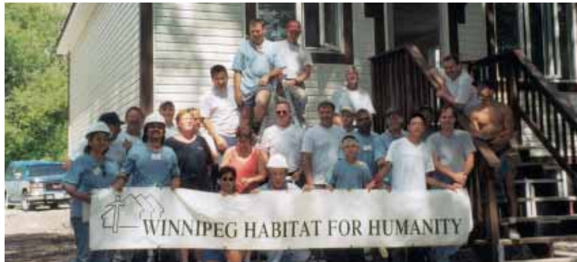
Habitat for Humanity — one of many worthwhile causes supported by Investors Group.