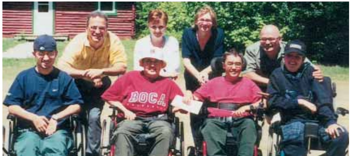
Summer camp organized by CORAMH for young people who are waging a battle against hereditary diseases.