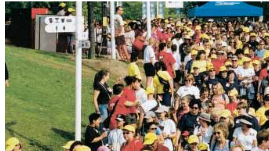
Starting Line for the Mother Daughter Walk for Heart and Stroke.